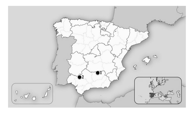
Figure 1. Map of Spain showing the sampling sites. Río Despeñaperros (1) and Arroyo del Moro (2). Mapa de España donde se muestran los sitios de muestreo. Río Despeñaperros (1) y Arroyo del Moro (2).