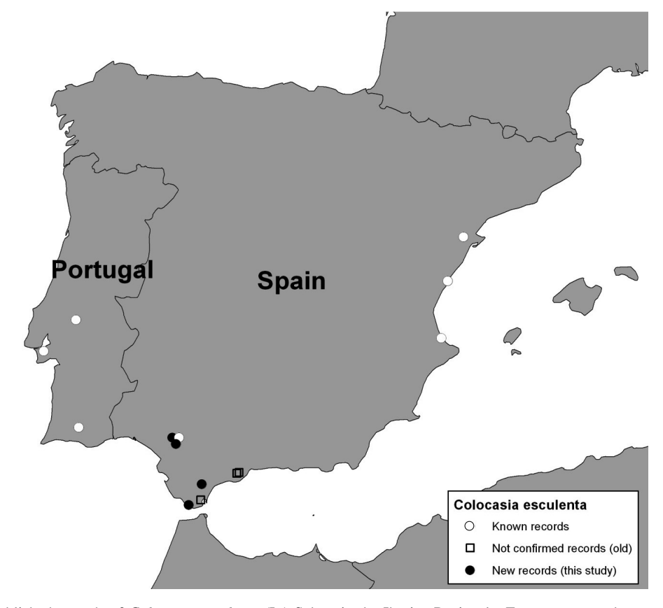
Figure 1. Published records of Colocasia esculenta (L.) Schott in the Iberian Peninsula. Empty squares show records indicated in the ancient literature, which could not be confirmed in this study, likely due to the heavy environmental modifications caused by humans in those areas. Records from Portugal must be considered at present as ephemerophytes escaped from cultivated lands. The remaining dots correspond to naturalised populations. Registros publicados de Colocasia esculenta ( L. ) Schott en la península ibérica. Los cuadrados vacíos muestran registros indicados por literatura antigua, que no pudieron ser confirmados en este estudio, probablemente por las profundas modificaciones ambientales provocadas por el ser humano en esas áreas. Los registros de Portugal deben ser considerados, por ahora, como efemerófitos escapados de cultivos adyacentes. El resto de registros corresponde a las poblaciones naturalizadas.

impacts as well as two specific questions related to the potential impacts on economy and human health. The questions were grouped into three categories (critical, key and secondary). Thus, if any of the critical questions has been answered with the option "a", the output is "high risk". If more than three key questions have been answered with the option "a", the output is "high risk". Each question receives generally from 0 to 5 points. If all questions are answered, the final sum varies between -14 and 63. To facilitate easier interpretation, this output value is then transformed onto a 0-100 scale, so that the final output is "low risk" (total sum <54 points) or high risk (total sum \geq 54 points). Therefore,